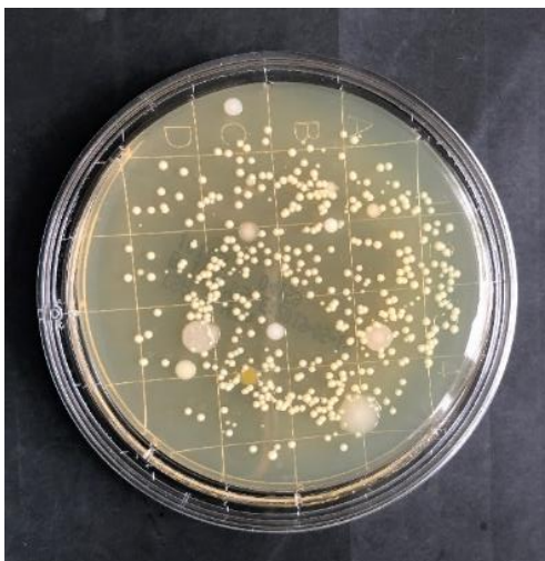
WITHOUT activated nanosilver active ingredient

and showed a reduction of up to 99.99%. The effectiveness depends on the concentration of the active ingredient.